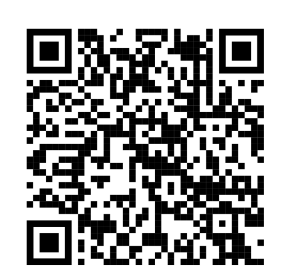
Subscription to Learning Group