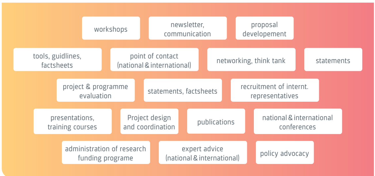
Figure 1: Areas of activity of the KFPE.

By any measure, the historical record of the KFPE's activities is remarkable in number and variety. The commission's activities have involved diverse stakeholders, addressed multiple topics and problems, and spanned geographic scales. They appear all the more notable in view of the commission's constitution as a loose network of members and associated organisations and the comparatively small budget at its disposal. Furthermore, much of its conceptual work and most of its operations were managed by the holder of a single part-time position, with committee members working on a voluntary basis or with a temporary mandate. The following illustration gives an indication of the areas of activity in which the KFPE has promoted North–South research partnerships over the past 25 years.