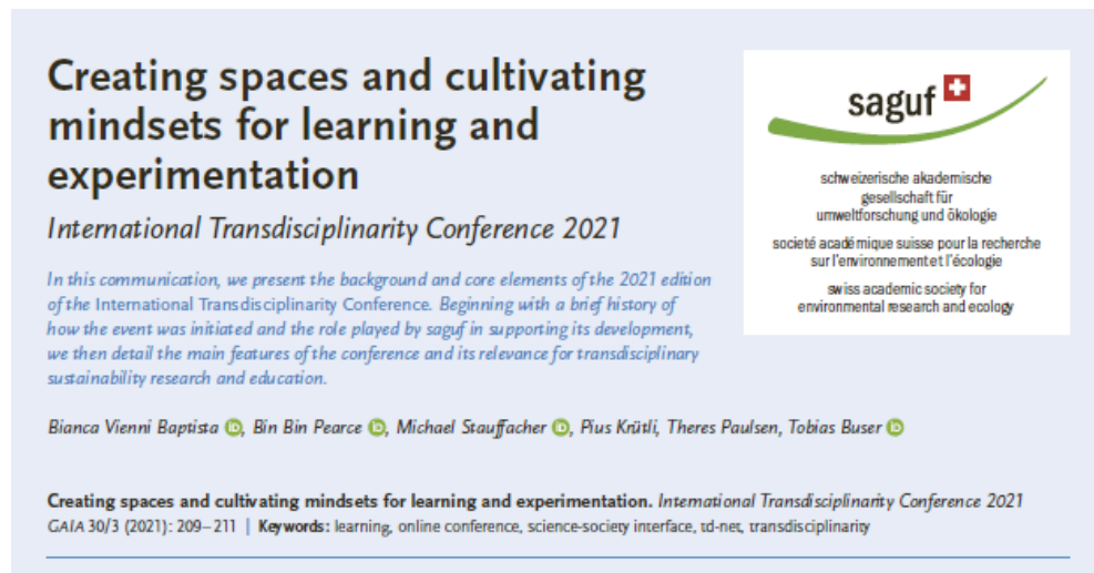
Figure 7 publication about the ITD conference in GAIA (see https://doi.org/10.14512/gaia.30.3.17 )